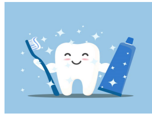
Key stage 1 visit